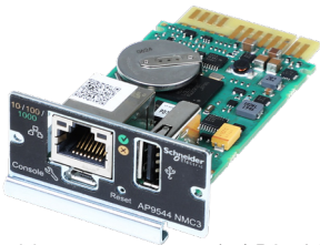
Management card: AP9544