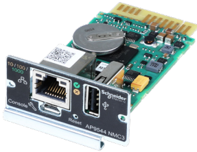
Management card: AP9544